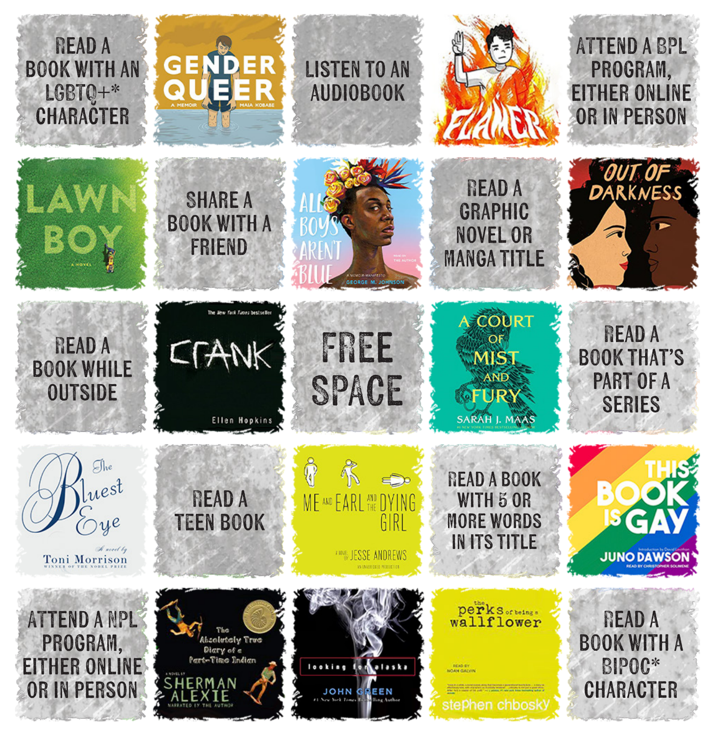
*BIPOC = Black, Indigenous, People of Color

Complete Let Freedon Read Bingo by reading materials and completing activities which fill spaces on the board below. To finish Let Freedon Read Bingo, complete the books/activities in one row of 5 spaces (vertical, horizontal, diagonal) or complete the books/activities listed in all 4 corners of the board. Then, no later than Friday, October 6 , bring your board to the Adult Services Desk on Bloomington Public Library's second floor to receive a sticker. The books chosen for the Bingo board are the Top 10 Most Challenged Books of 2022, according to the American Library Association's Office for Intellectual Freedom.